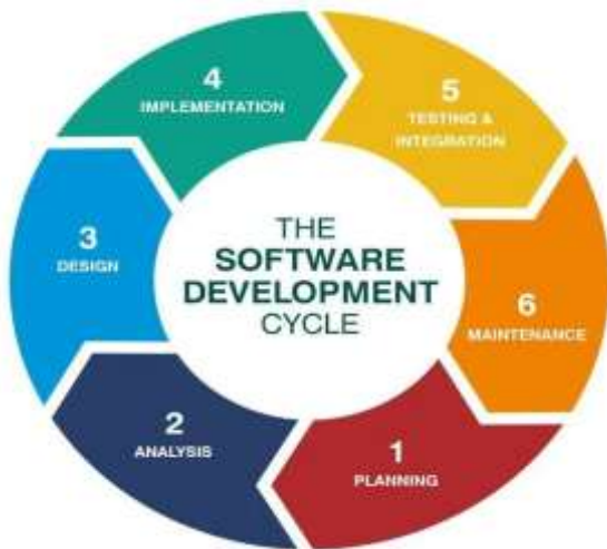
Fig. 1. Software Development Life Cycle (SDLC) Phases

Software engineers design, create, and provide software systems through a sequence of activities and procedures known as the software development process. There are several steps to the process, including collecting requirements, designing, implementing, testing, and maintaining. Systematic software development entails a lifecycle (SDLC) that includes the steps shown in Fig. 1. The following procedures must be followed: preparation, investigation, design, execution, evaluation, incorporation, and upkeep.